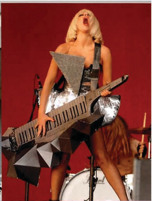
The many faces of Lady Gaga: (clockwise from above left) piano-playing teen prodigy; gyrating onstage at Lollapalooza; going back to the '80s; you don't get that with Pixie Lott; someone's had an accident with the ketchup; rocking the Courtney Love look; picking up an MTV award; auditioning for Twilight; and (centre) getting things off her chest.